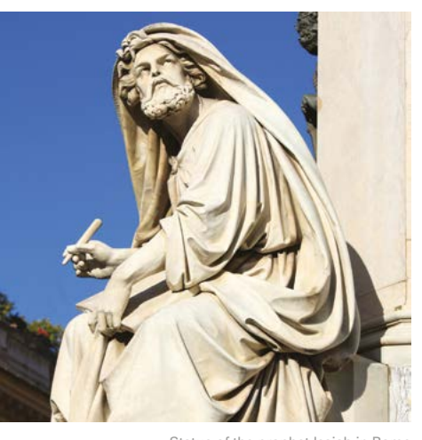
Statue of the prophet Isaiah in Rome

saiah is the story of God's messages through the prophet as they endured being assailed by the surrounding empires. People were at a loss to understand how God could let it happen. After all, God had given them the land when they escaped from Egypt. Isaiah and the other prophets explained that